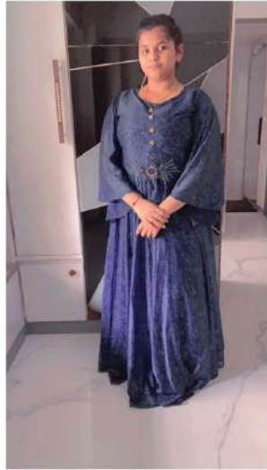
Annie besant was an British socialist Who played an important role in gaining independence