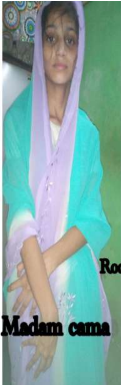
Roce Madam Cama