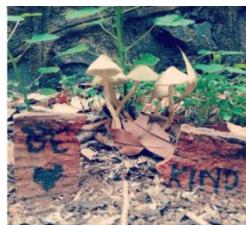
THERE ARE HIDDEN TREASURES IN PLACES WHERE NOBODY CARES TO SEEK.