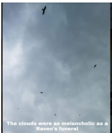
The clouds were as melancholic as a Raven's funeral