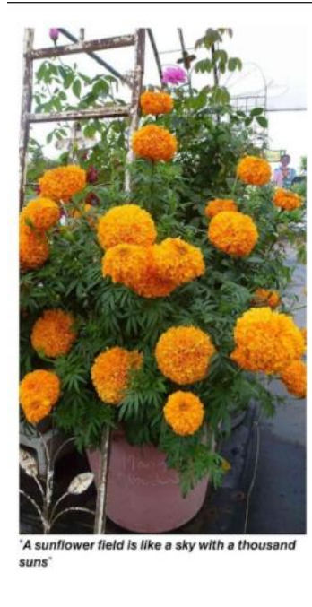
"A sunflower field is like a sky with a thousand suns"